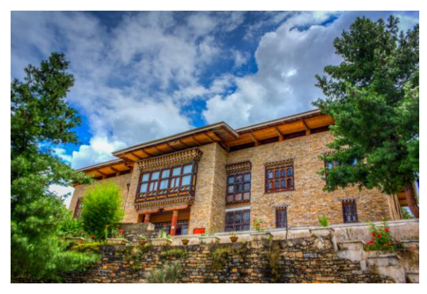
National Museum of Bhutan

For those who are up for it, hike a further 01hr uphill to visit the monastery, afterwards retrace your steps back to the base where your driver shall be waiting to escort you to the 7<sup>th</sup> century Kichu Lhakhang and National Museum of Bhutan . Kichu Lhakhang is tucked away just a few minutes drive from the main town of Paro, one of the oldest monasteries in Bhutan.