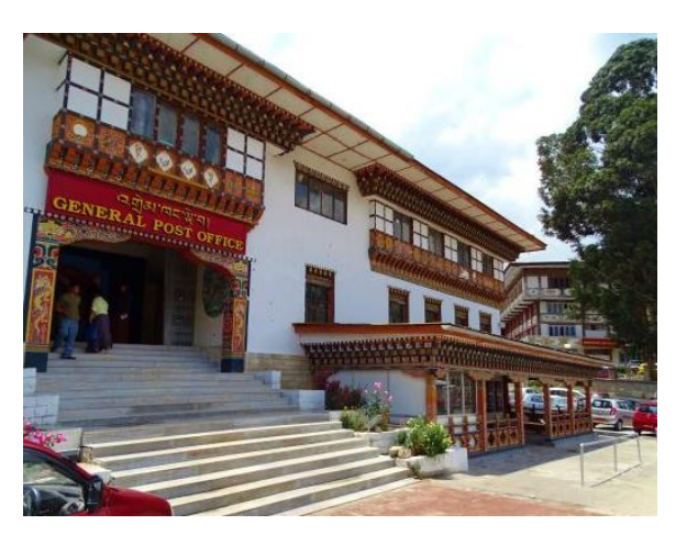
Bhutan Postal Museum

Your guide shall assist you with checking in to your hotel where you may relax prior to being escorted to a restaurant for your first taste of Bhutanese cuisine for lunch! Afterwards you will be led on your first excursion around the Land of the Thunder Dragon .