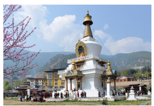
National Memorial Chorten

Enjoy breakfast in the comfort of your hotel before you embark to see the National Memorial Chorten and the Thimphu Tsechu Festival . Welcome to the most frequented religious site in Thimphu, the National Memorial Chorten was built in 1974 in memory of the late Third King. People from across the globe travel here to pray and circumambulate, see how Bhutanese people devote themselves to daily prayers at this Buddhist stupa.