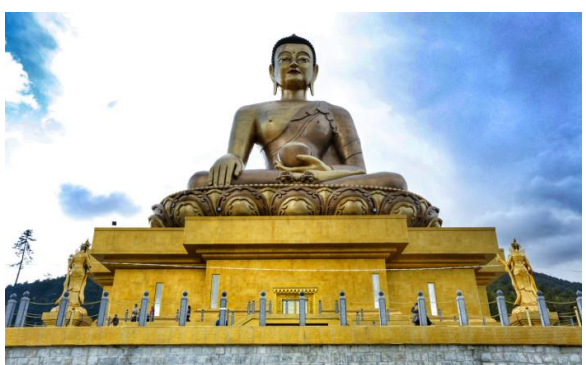
Bhutan Postal Museum